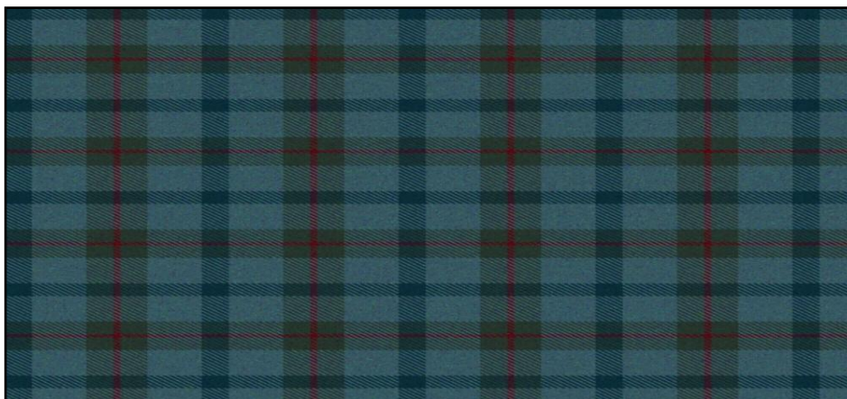
The Kyleakin Tartan

A woven sample of the Kyleakin tartan has been received by the Scottish Register of Tartans for permanent preservation in the National Records of Scotland. The official Certificate of Registration is now held by KLHS.